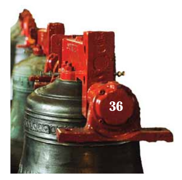
Ringing at Holy Cross, Pattishall