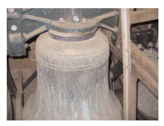
1317 William de Flint bell at Cold Ashby.

Inspected during 2018. We have eradicated a clapper flight/slider collision path issue on one of the bells. I only learnt of this issue upon witnessing a situation whereupon the bell abruptly came to a halt during a branch ringing meeting. Incorrect clock and chime hammer actions were also attended to at the same time.