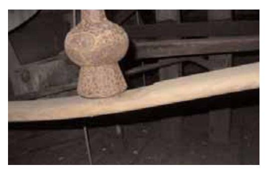
Tenor flight is colliding with slider bar at West Haddon.

Inspected during 2018. We have successfully carried out the fitting of 5 new and 5 pre-used ceiling/floor bosses to the ringing chamber/clock-room interface rope routes. The original improvised "bosses" (soil pipe connectors) had allowed a rapid deterioration of each sally when the ringing floor was raised to its present level. We also successfully attended to a tenor clapper/slider collision path issue. We will be returning to W.H. during 2019 in order to commence further enhancements to the installation. Many thanks to Peter Clifton for the pre-used bosses from L.B. Church.