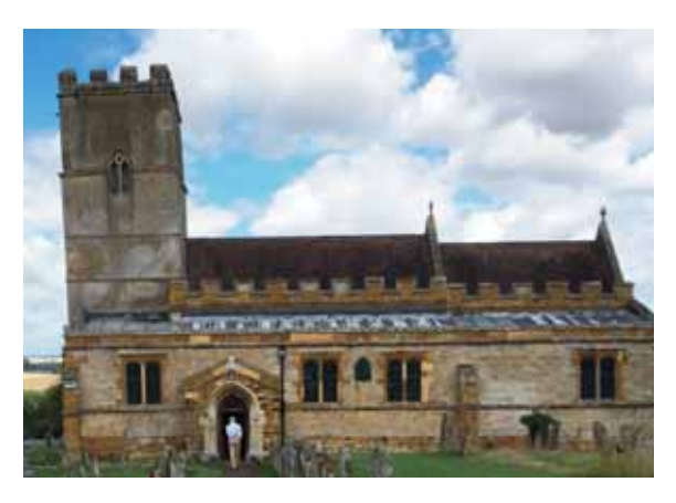
The leaning tower of Church Stowe

(helping ring the four bells for a structural engineer to measure the leaning tower's movements), Everdon, Bugbrooke and celebrating Brackley Town Hall clock bell restoration.