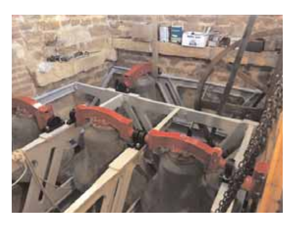
The refurbished bell installation nearing completion at Guilsborough.