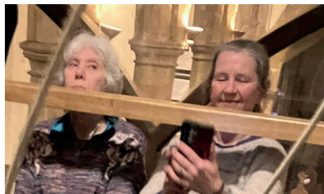
Sit up straight at Welton!