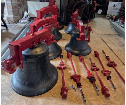
Bells' Return July 2025

Greetham church bells are also the village's war memorial. The original bells were recast and rehung on a new steel frame in 1923 and dedicated as such. Villagers at the time raised £600 for this work. The significance of the bells as our war memorial was portrayed by one of villagers who wrote and delivered a short account at our village celebration. "The Story of the Bells", emphasised that, although the men who died as a result of war did not hear the bells, we can remember them every time that we do! A very thought-provoking and poignant reminder for everyone.