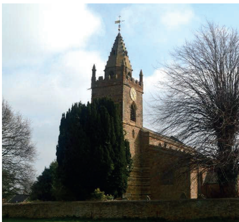
Holy Cross, Milton Malsor

Taylor's report detailed some of the history of the bells. The 5 bells at Holy Cross, Milton Malsor were cast by Bagley in 1686, though they had their canons removed when they were tuned in 1961. They are in a steel frame, with cast iron headstocks, ball bearings and Hastings stays, supplied by Taylor Bell Foundry in 1961.