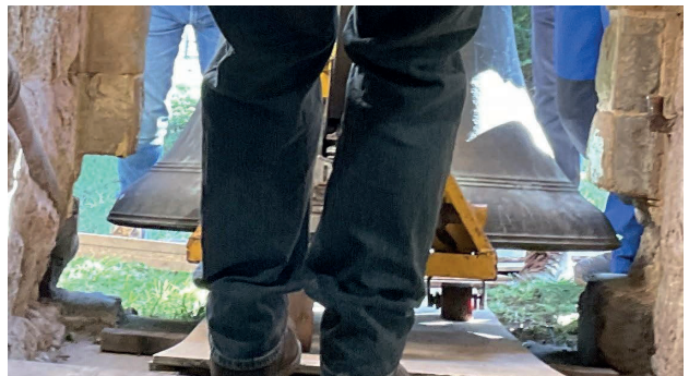
Minor masonry modifications required to let the tenor pass