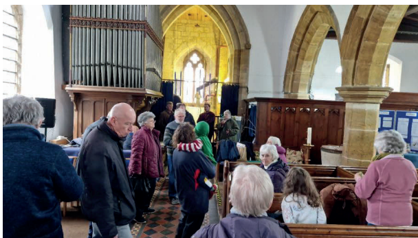
Evening practice at Blisworth

At the General Management Committee of the Guild on the 7 th March, the transfer of Holy Cross, Milton Malsor to the Towcester Branch was