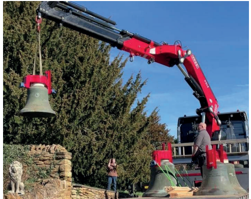
Bell 3 with canon-retaining headstock