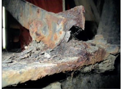
Corroded Steel Frame

For several years prior to 2022, the bells of St Mary the Virgin were not rung regularly. This changed in 2023 when we recruited a new team of bell ringers. After a few practices the inevitable happened, a broken stay or two! Whilst replacing the stay, the poor state of the bells, alongside rusting and corrosion of the bell frame, were noted. Urgent action was needed to repair, restore and ultimately make them safe. Three bell-hanging firms all confirmed our worst fears, the lot needed to come out!