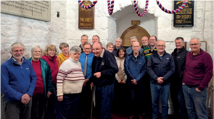
Branch practice at Holy Cross, Pattishall